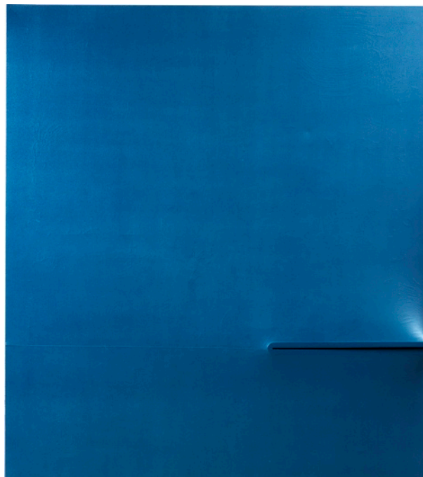
Agostino Bonalumi, Blu , 1972, Vinyl tempera on shaped canvas, 180 x 160 cm / 70.9 x 63 inches, Courtesy Tornabuoni Art

For its third participation in the Biennale des Antiquaires, Tornabuoni Art Paris has confirmed that it will demonstrate its commitment to Italian artists from the second half of the 20th century by showcasing a selection of emblematic works from this generation on its stand: Alighiero Boetti, Lucio Fontana and Paolo Scheggi among others.