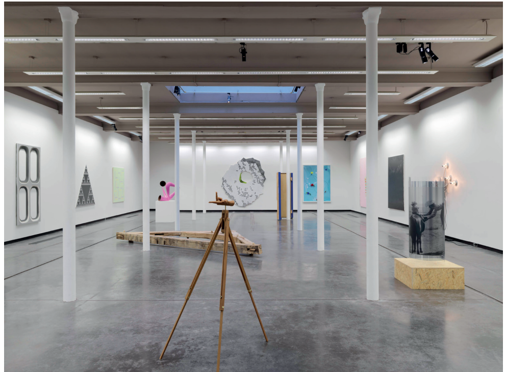
Exhibition view from the inauguration rue du Mail

On 4th February 2016, Galerie Triple V inaugurated its second exhibition space on 5, rue du Mail, in the second arrondissement of Paris close to Place des Victoires.