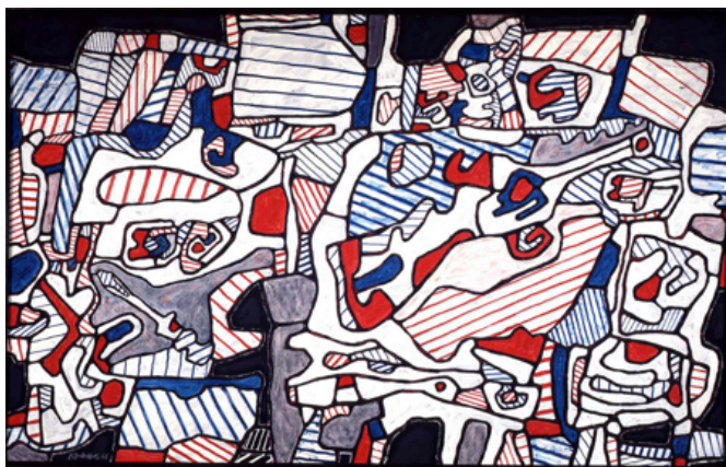
Jean Dubuffet, Site domestique au fusil espadon avec tête d'Inca et petit fauteuil à droite , 1966