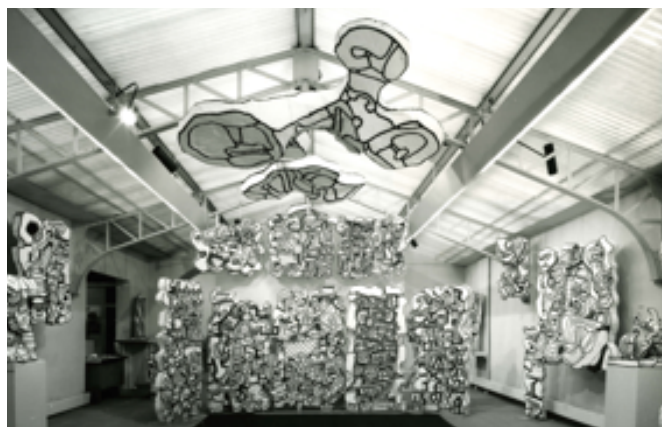
Photograph of the Jean Dubuffet exhibition held at the gallery in 1968.