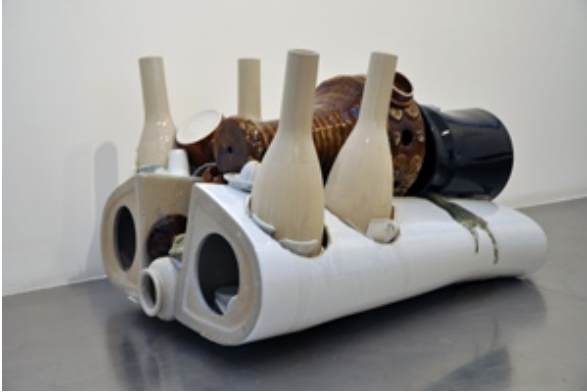
Dewar & Gicquel, Mixed Ceramics (n°1), 2010, ©Galerie Loevenbruck, Paris