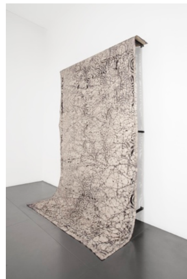
Morgane Tschiember, Skin , 2013

Lefebvre & Fils Gallery is pleased to present Tout feu Tout flamme , an unseen group show of eleven international artists around ceramic works.