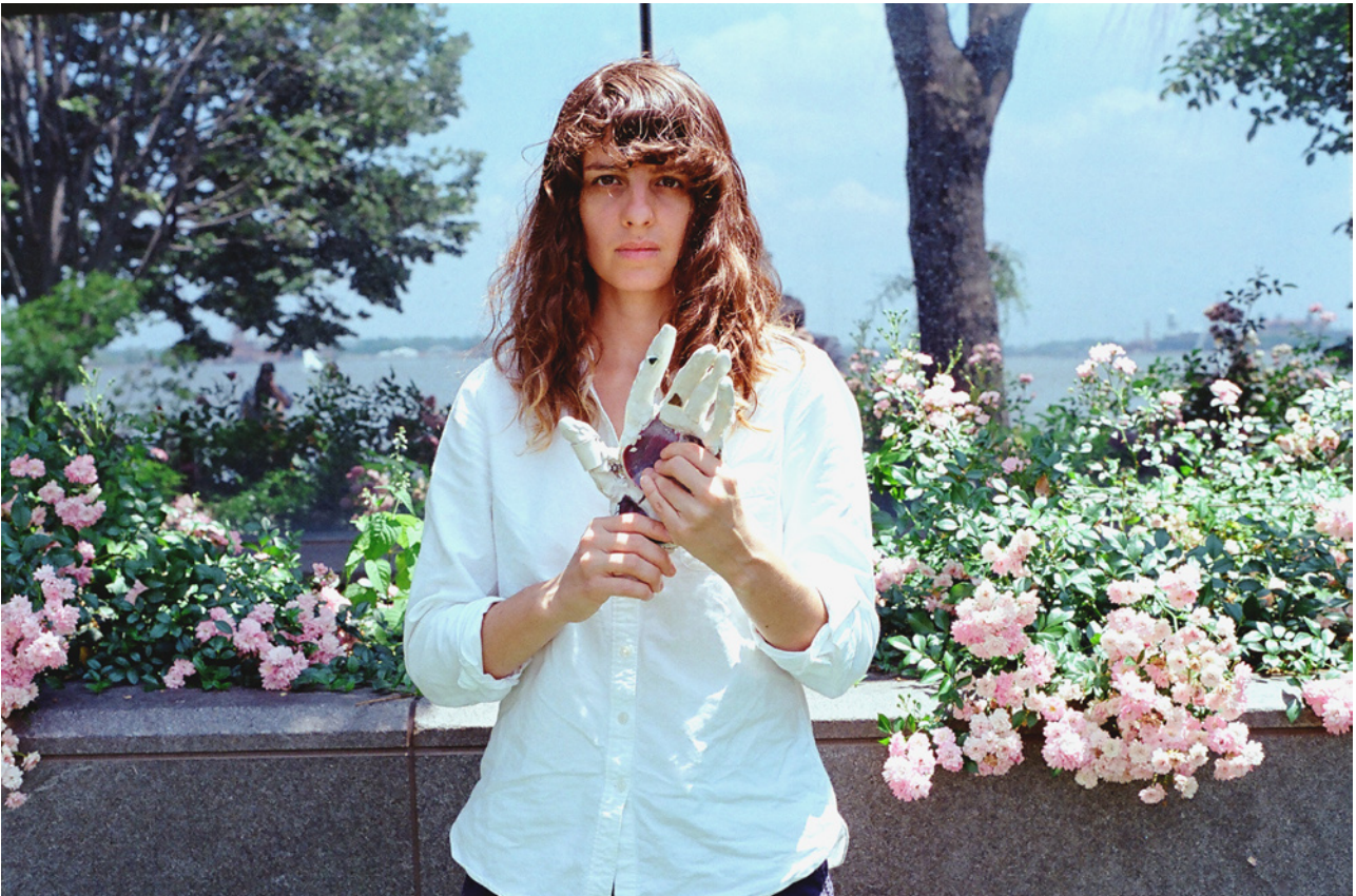
Photograph by Wilson Cameron, 2013

A Solo Exhibition at Lefebvre & Fils gallery Octobre 23 rd 2013 - January 31 st 2014