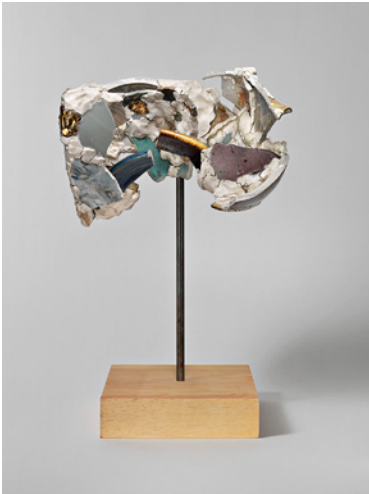
Bail Flail Fail , Robin Cameron, 2013, 16 x 9.5 x 9 inches