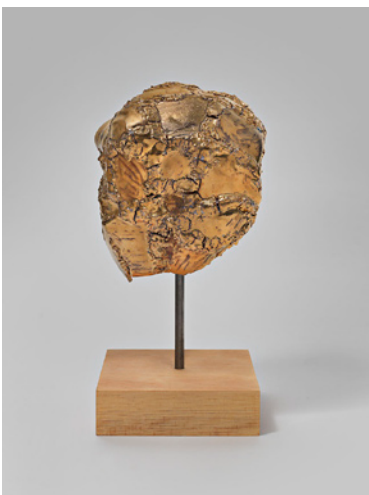
The Gold Debauch , Robin Cameron, 2013, 13 x 6 x 6 inches