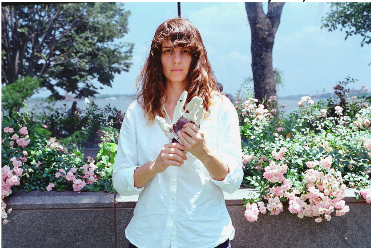
Photograph by Wilson Cameron, 2013

A Solo Exhibition on view October 23 rd 2013 - January 31 st 2014