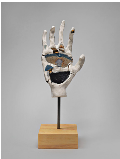
The Worst Stop , Robin Cameron, 2013, 15.25 x 5 x 5 inches

"I've always tried to see the positive usefulness and strength in objects and situations."