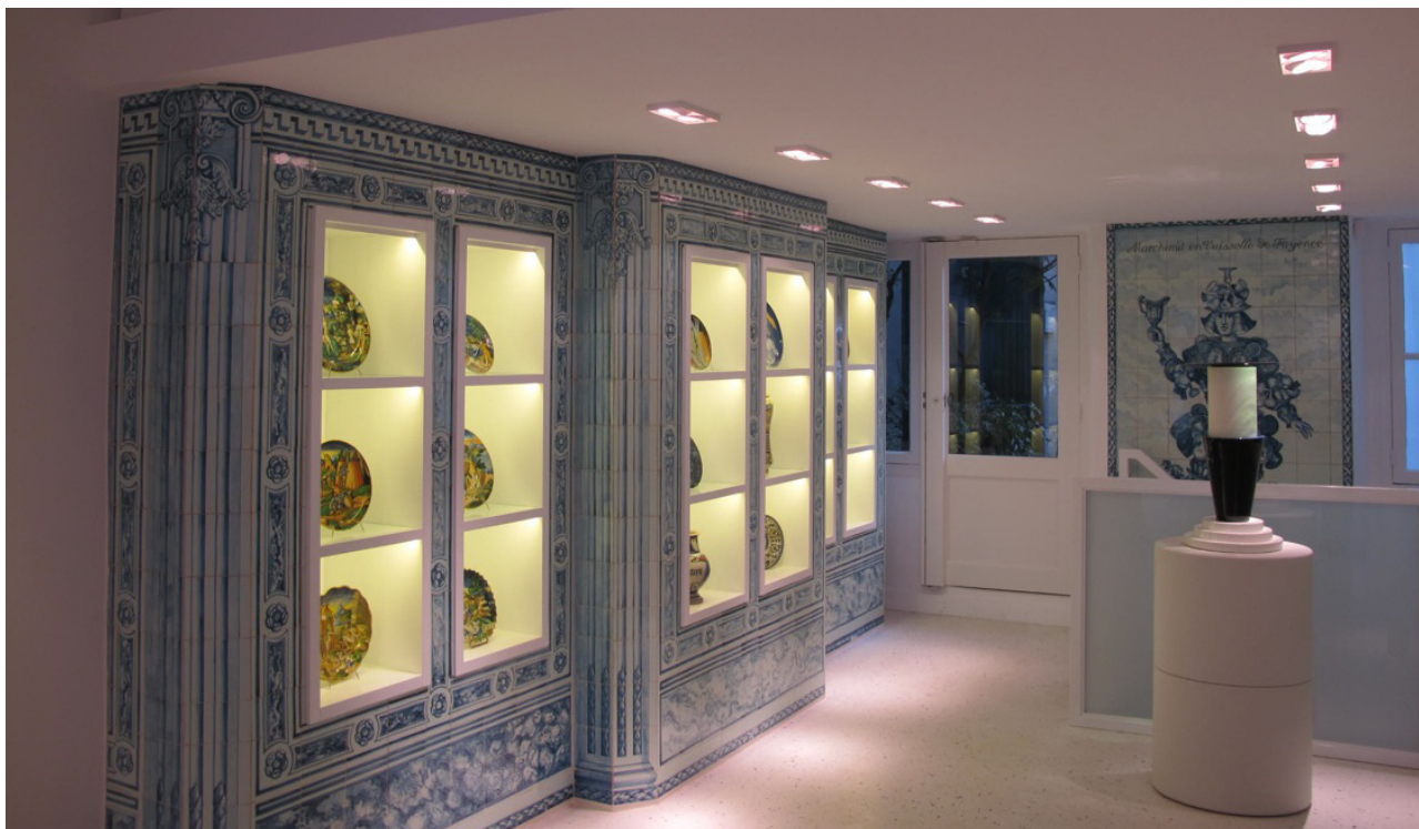
Lefebvre & Fils gallery, 24 rue du Bac, Paris 7 e

Established in 1880 by Henri Lefebvre, Lefebvre & Fils gallery is dedicated to old and modern ceramics from France and Europe. Located rue du Bac in the curators and art collectors' favourite area in Paris, Lefebvre & Fils gallery has contributed to the greatest private and public collections in France, as well as all over the world. Well-known for its expertise, Lefebvre & Fils gallery is now oriented towards contemporary art under the influence of its director, Louis Lefebvre.