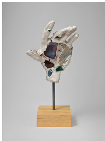
The Grasp and Crumble , Robin Cameron, 2013, 14 x 7 x 6 inches