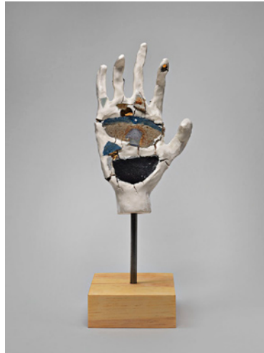
The Worst Stop , Robin Cameron, 2013, 15.25 x 5 x 5 inches