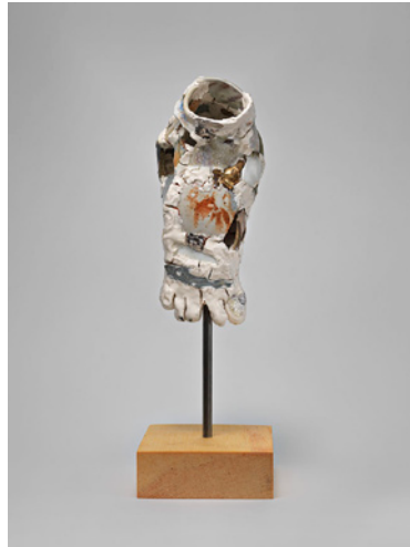
Low Woe Toe , Robin Cameron, 2013, 15.5 x 5.5 x 5.5 inches