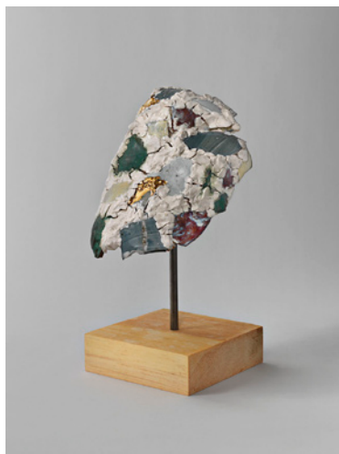
The Loud Defeat , Robin Cameron, 2013, 14 x 7 x 8 inches