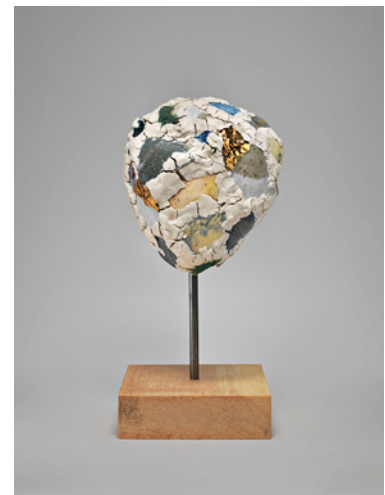
The Last Promise , Robin Cameron, 2013, 13 x 7 x 6 inches