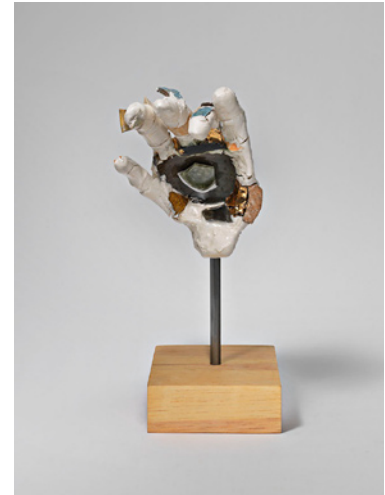
The Let Down , Robin Cameron, 2013, 13 x 4.5 x 7 inches