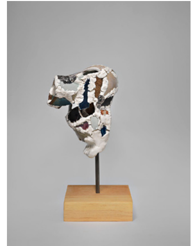
The Flop , Robin Cameron, 2013, 15 x 6.5 x 5.5 inches