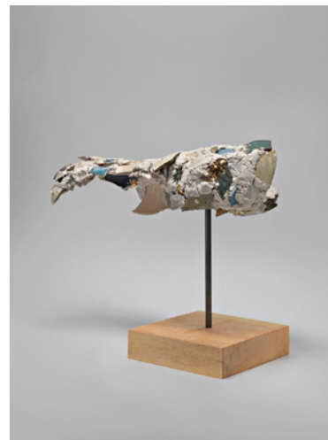
The Slight Misadventure , Robin Cameron, 2013 13 x 8 x 15.5 inches