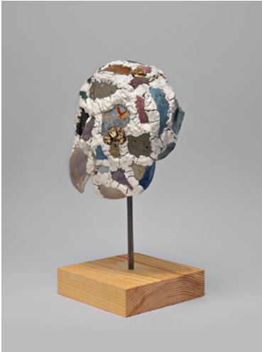
The Slow Downfall , Robin Cameron, 2013, 16 x 8 x 7 inches