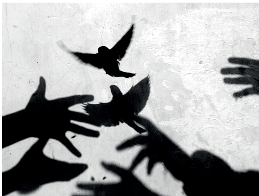
Hou-chou moe, projector, mixed media