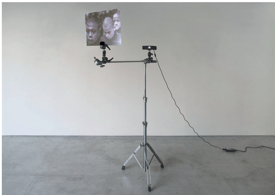
Takupatsu Heads - Microphone Stand h156 x w82 x d34 cm film, antique microphone stand, projector, acrylic board, mixed media