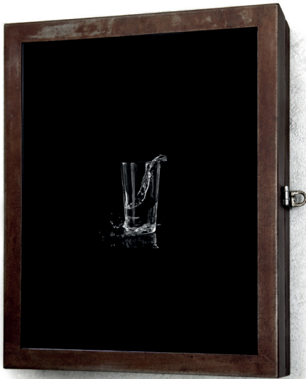
Storm in a Glass , 2014 43 x 38 x 8.5 cm film, switchboard box, mixed media

The "Storm in a Glass" represents with a simple image all the weight and the significance of a crucial historical moment in the life of the country, which will maybe change the destiny and the course of their lives.