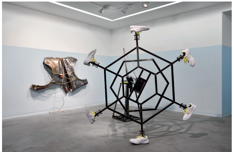
Exhibition view, Pierre Gagnard, 2 Cups Stuffed, 30 January until 5 March 2016