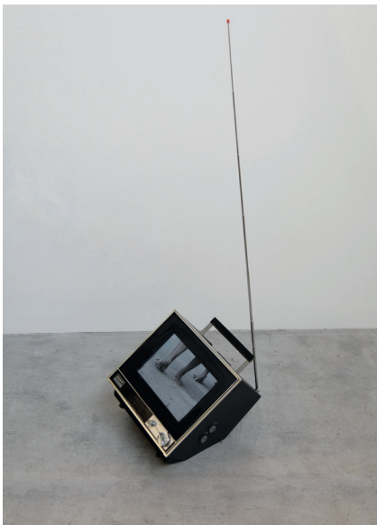
Takuhatsu Feet - TV h27 x w28.5 x d26 cm SONY SOLID STATE film, mixed media

Galerie Eric Mouchet is proud to present the exhibition "HOU-CHOU" releasing birds dedicated to the Japanese artist Ken Matsubara, from 23 April until 28 May.