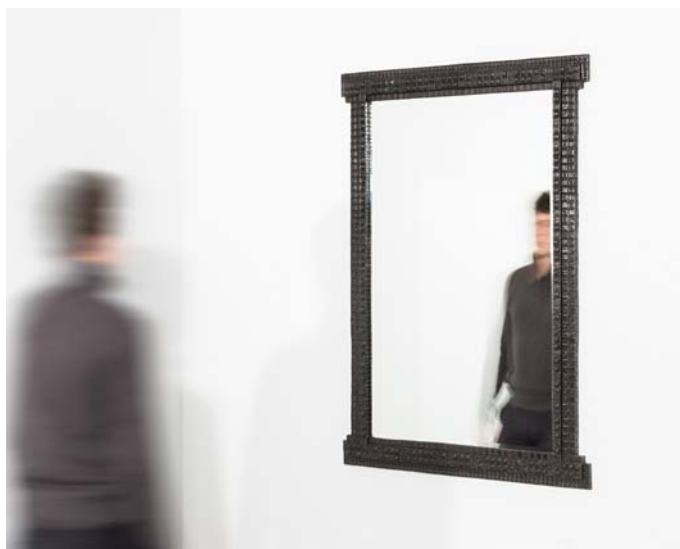
INGRID DONAT | MIROIR GRENADE 2016 BRONZE H124 L87 W3 CM / H47.6 L44.9 W1.4 IN LIMITED EDITION OF 8 + 4 AP