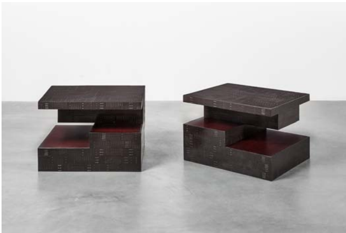
INGRID DONAT | ARTBOOK CHEVET 2011 BRONZE, PARCHMENT H44 L60 W60 CM / H17.3 L23.6 W23.6 IN LIMITED EDITION OF 8 + 4 A