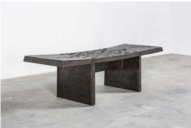
INGRID DONAT | BANC TRIBAL 2014 BRONZE, LEATHER H34.5 L111 W39 CM / H13.6 L43.7 W15.3 IN LIMITED EDITION OF 8 + 4 AP