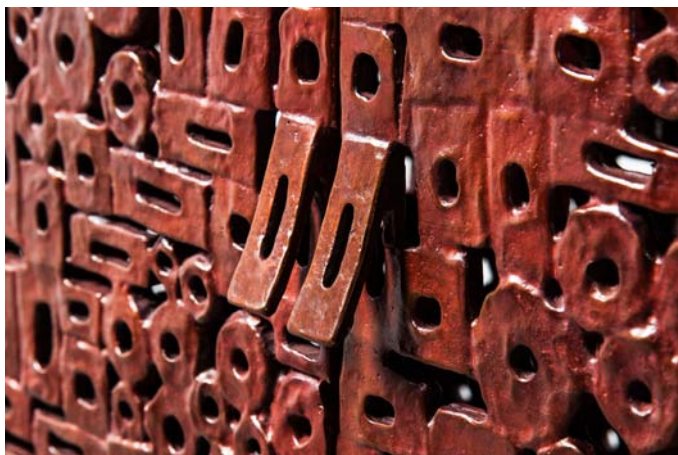
INGRID DONAT | CABINET KLIMT | DETAIL 2015 BRONZE H117 L76 W33 CM / H46.1 L29.9 W13 IN LIMITED EDITION OF 8 + 4 AP