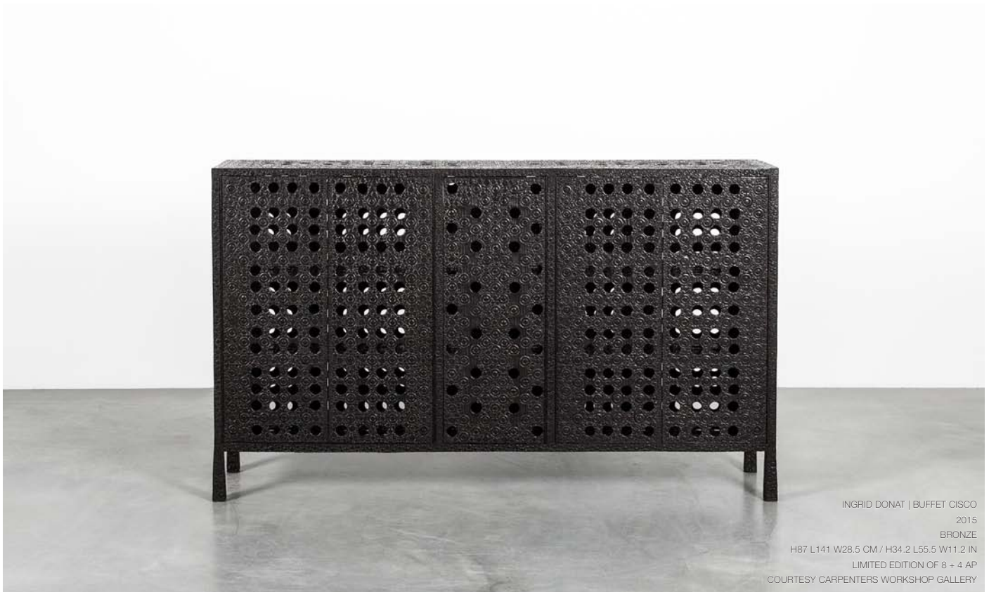
INGRID DONAT | BUFFET CISCO 2015 BRONZE H87 L141 W28.5 CM / H34.2 L55.5 W11.2 IN LIMITED EDITION OF 8 + 4 AP