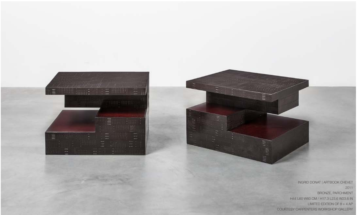
INGRID DONAT | ARTBOOK CHEVET 2011 BRONZE, PARCHMENT H44 L60 W60 CM / H17.3 L23.6 W23.6 IN LIMITED EDITION OF 8 + 4 AP

From a more figurative representation to a more abstract expression, Ingrid Donat's work confirms the idea that furniture and objects can be subject to a sensorial translation with patterns that flower on surface.