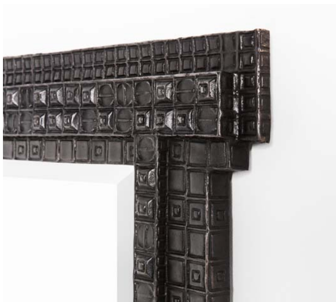
INGRID DONAT | MIROIR GRENADE | DETAIL 2016 BRONZE H124 L87 W3 CM / H47.6 L44.9 W1.4 IN LIMITED EDITION OF 8 + 4 AP COURTESY CARPENTERS WORKSHOP GALLERY