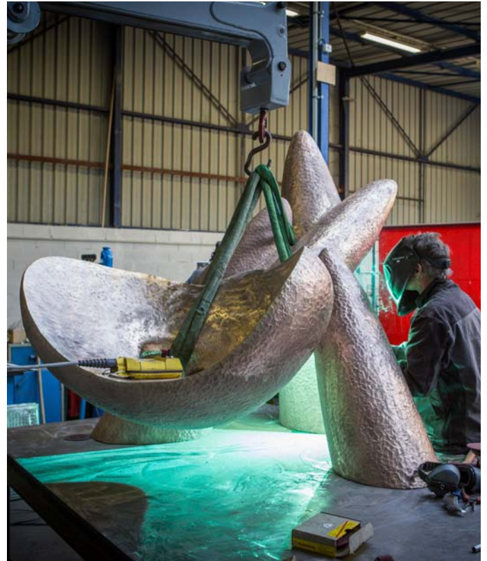
CARPENTERS WORKSHOP | ROISSY L: EXTERIOR VIEW | R: 'VEILED IN A DREAM' BY WENDELL CASTLE IN PRODUCTION