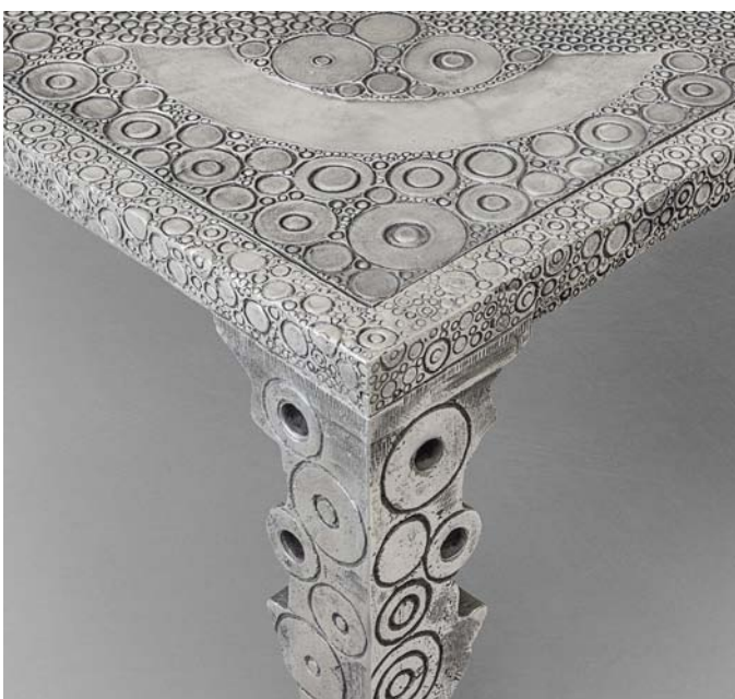
INGRID DONAT | TABLE BASSE ANNEAUX (4 PLAQUES) | DETAIL 2013 BRONZE H44 L152.5 W153 CM / H17.3 L60 W60.2 IN LIMITED EDITION OF 8 + 4 AP