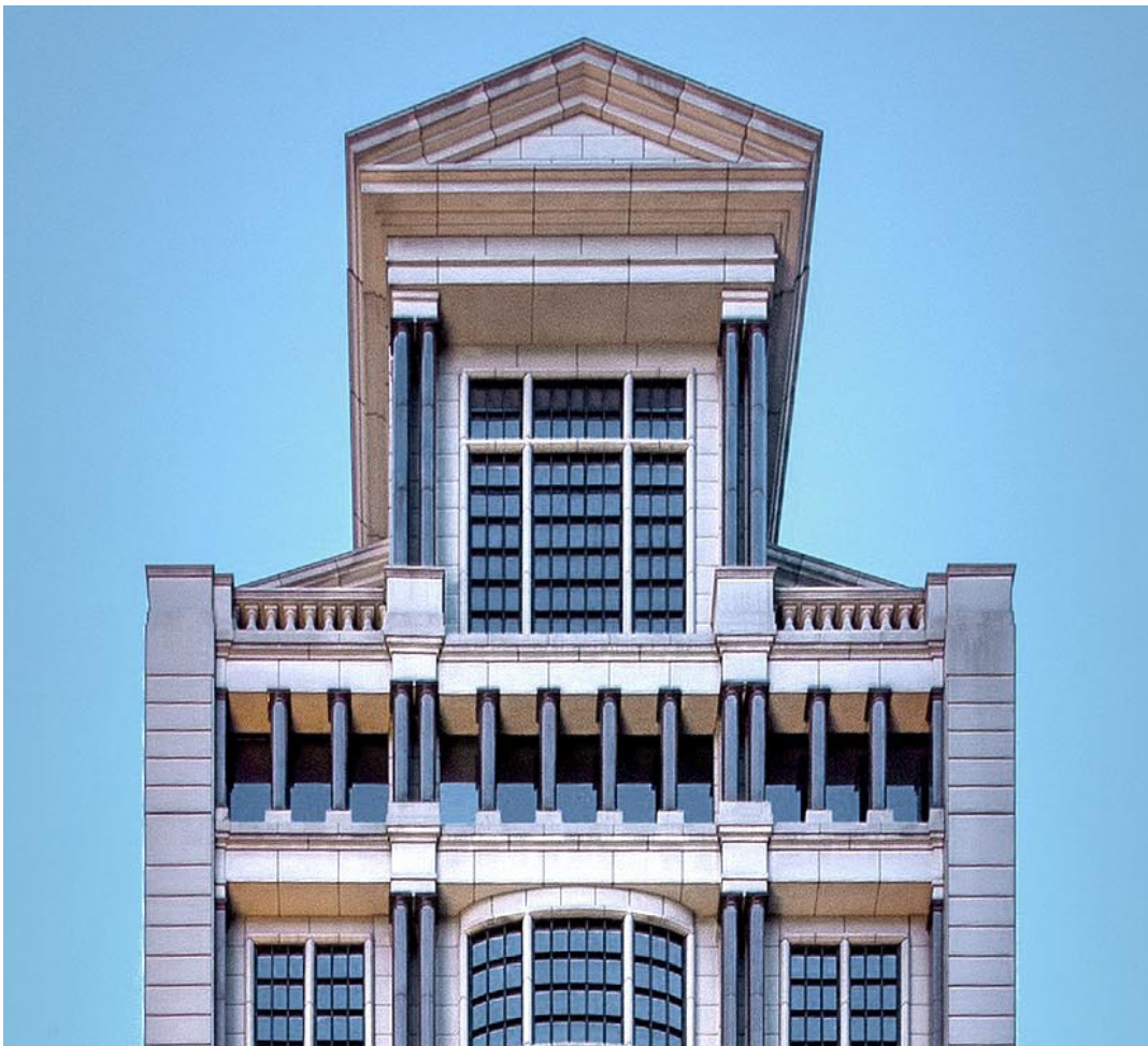
NEW YORK | CARPENTERS WORKSHOP GALLERY