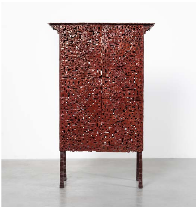
INGRID DONAT | CABINET KLIMT 2015 BRONZE H117 L76 W33 CM / H46.1 L29.9 W13 IN LIMITED EDITION OF 8 + 4 AP