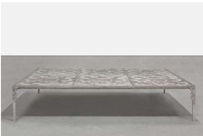
INGRID DONAT | TABLE BASSE ANNEAUX (4 PLAQUES) 2013 BRONZE H44 L152.5 W153 CM / H17.3 L60 W60.2 IN LIMITED EDITION OF 8 + 4 AP COURTESY CARPENTERS WORKSHOP GALLERY