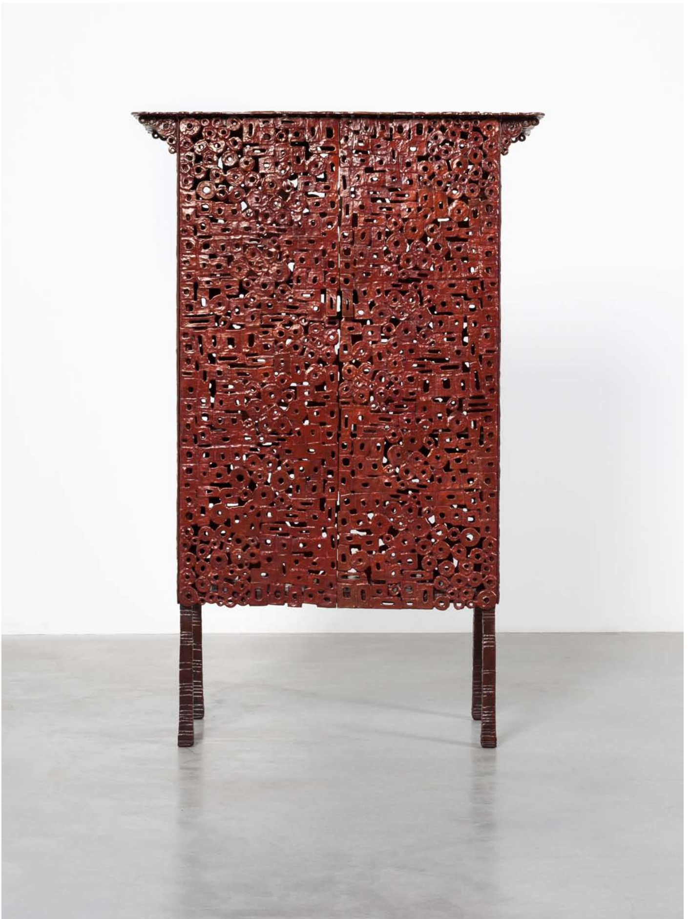
INGRID DONAT | CABINET KLIMT | 2015 COURTESY CARPENTERS WORKSHOP GALLERY