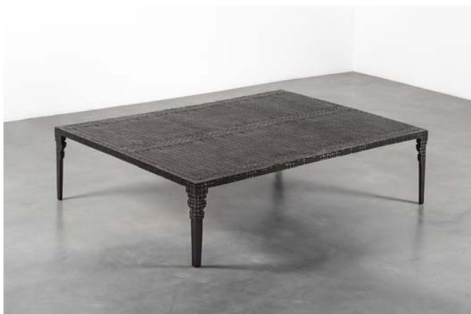
INGRID DONAT | TABLE BASSE KOU MBA 2016 BRONZE H45 L184 W125 CM / H17.7 L72.4 W49.2 IN LIMITED EDITION OF 8 + 4 AP