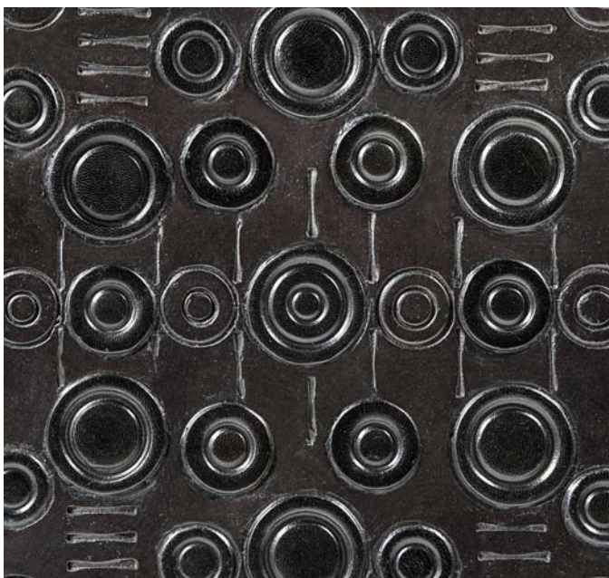
INGRID DONAT | BANC TRIBAL | DETAIL 2014 BRONZE, LEATHER H34.5 L111 W39 CM / H13.6 L43.7 W15.3 IN LIMITED EDITION OF 8 + 4 AP