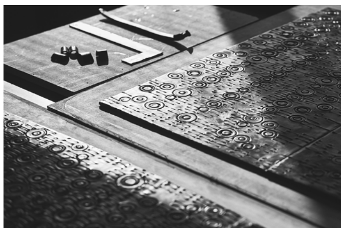
INGRID DONAT | ENGRAVING WORK IN PROCESS