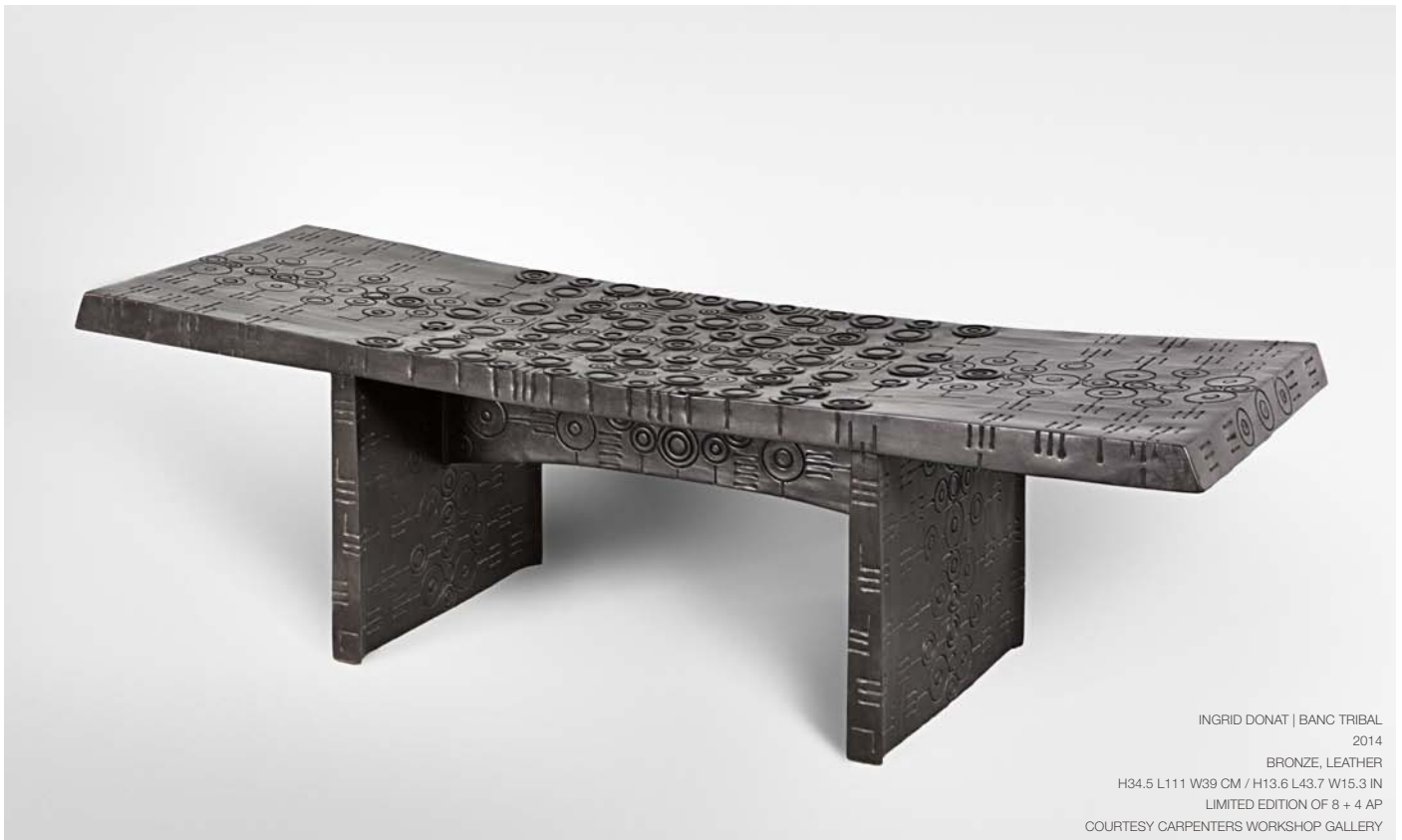
INGRID DONAT | BANC TRIBAL 2014 BRONZE, LEATHER H34.5 L111 W39 CM / H13.6 L43.7 W15.3 IN LIMITED EDITION OF 8 + 4 AP COURTESY CARPENTERS WORKSHOP GALLERY