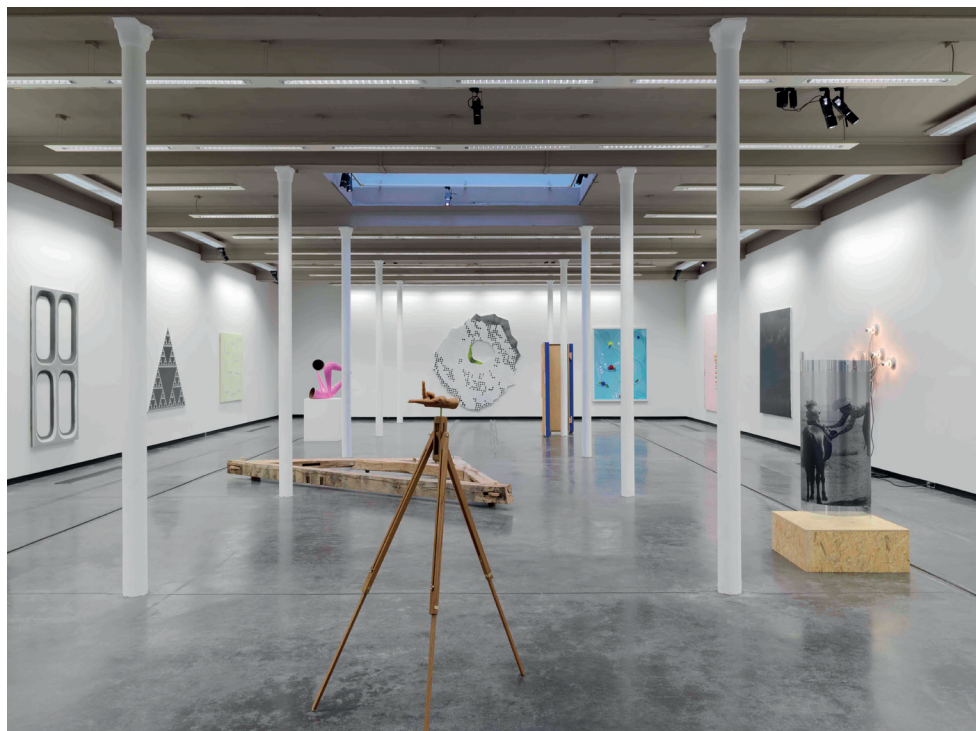
Inaugural exhibition view rue du Mail

On 4th February 2016, Galerie Triple V inaugurated its second exhibition space on 5, rue du Mail, in the second arrondissement of Paris close to Place des Victoires.