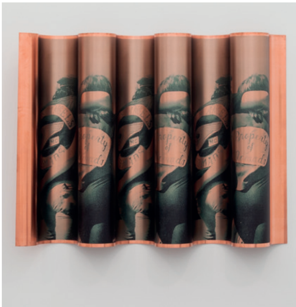
Servane Mary, Untitled (Property) , 2016 - Inkjet cartridge print on copper, 122 x 165 x 23 cm

EXHIBITION FROM 8 TO 24 SEPTEMBER AND FOR 18 OCTOBER TO 5 NOVEMBER 2016 OPENING THURSDAY 8 SEPTEMBER 2016, FROM 6PM