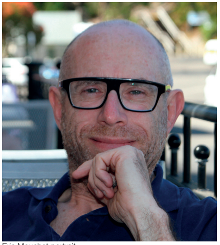
Eric Mouchet portrait