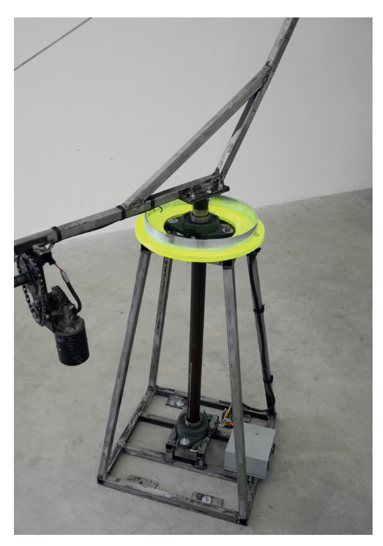
Mouvement vers une sémantique de Fils2pute (D'Après Adidas Lab) (Movement towards Son of a Bitch semantics (From Adidas Lab)), 2015 Brushed metal, varnish, ball bearings, windscreen wipers, power supply 12V 20 AMP 6MM cables, turnbuckles, springs, sneakers, 350x350x200 cm