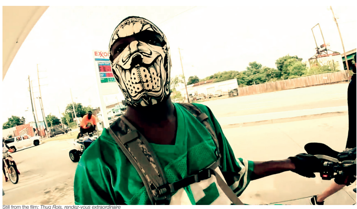
Still from the film: Thug Rois, rendez-vous extraordinaire avec mon frère (Thug King, an extraordinary meeting with my brother), 2016 Shot with HD video 720P, 48 min