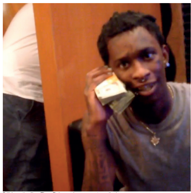
Still from the film: Thug Rois, rendez-vous extraordinaire avec mon frère (Thug King, an extraordinary meeting with my brother), 2016 Shot with HD video 720P, 48 min