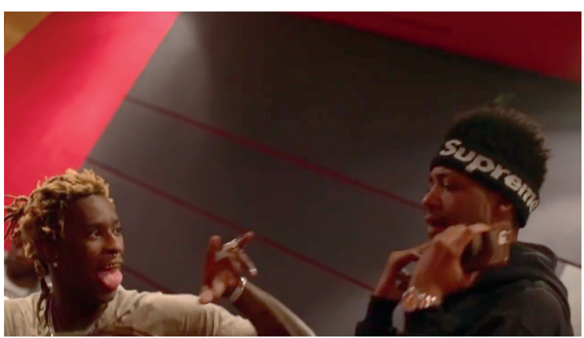
Still from the film: Thug Rois, rendez-vous extraordinaire avec mon frère (Thug King, an extraordinary meeting with my brother), 2016 Shot with HD video 720P, 48 min