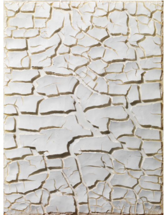
Alberto Burri, Cretto L.A. , 1975 acrovynil on cellotex cm 40.5 x 15.9 / in 15.9 x 11.8

The undeniable intellectual and artistic summit that are the 1960s played an important role in the unification of a generation of artists such as Fontana, Burri, Simeti, Bonalumi and Scheggi, founders of the Italian Avant Garde. This artistic movement continues to inspire today and has influenced the works of young contemporary artists such as Francesca Pasquali. For its third participation at Art Basel – Miami Beach, Tornabuoni Art has chosen to exhibit a selection of works from of this exceptional period.