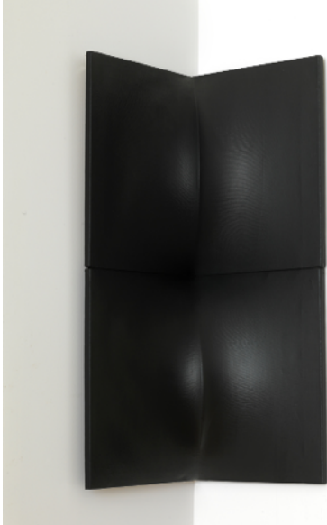
Enrico Castellani, Doppio angolare nero , 1963 acrylic on shaped canvas cm 100 x 39.8 x 39.8 / in 39.4 x 15.7 x 15.7

Tornabuoni Arte was founded in 1981 by Roberto Casamonti and is specialized in Italian art of the second half of the 20th Century. It established exhibition spaces in Milan in 1995, Portofino in 2001, Forte Dei Marmi in 2004 and on October 1 st 2009 in Paris, 16 avenue Matignon in the 8 th district.