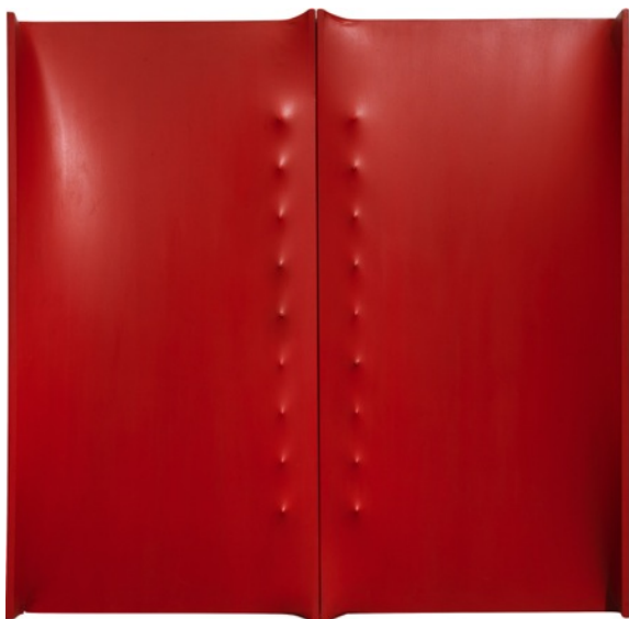
Enrico Castellani, Dittico rosso , 1963 vinyl tempera on shaped canvas cm 152 x 157 x 20 / in 59.8 x 61.8 x 7.9