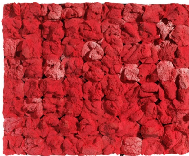
Francesca Pasquali, Setole , 2012 mixed media cm 40 x 50 x 12 / in 15.7 x 19.7 x 4.7