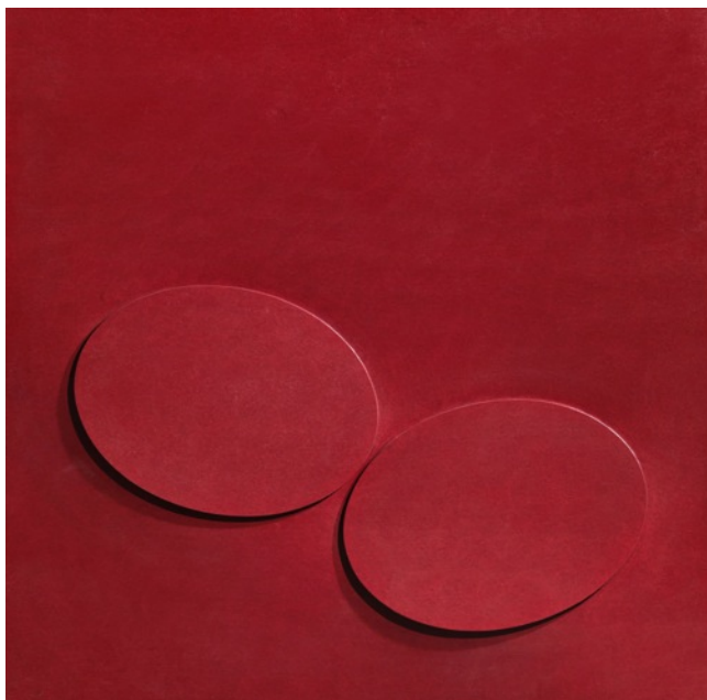
Turi Simeti, Due ovalie alizarin crimson , 2011 acrylic on shaped canvas, cm 100 x 100 / in 39.4 x 39.4