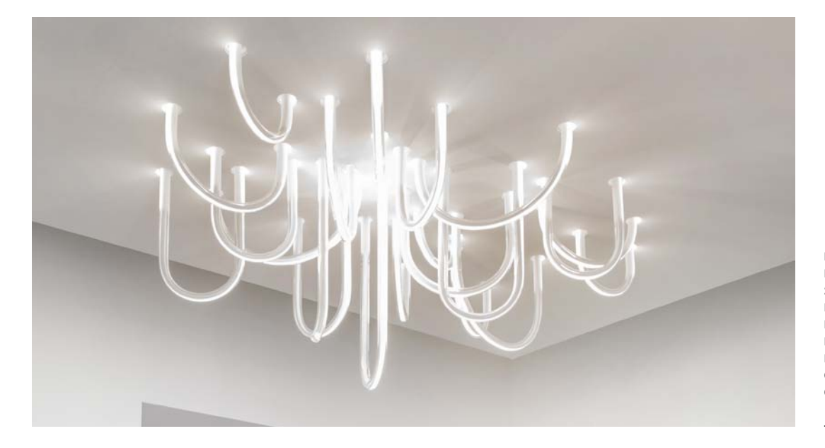
MATHIEU LEHANNEUR LES CORDES (PARIS) 2014 HAND MADE GLASS TUBES, FLEXLED H90 L250 W150 CM H35.4 L98.4 W59.1 IN LIMITED EDITION OF 8 + 4 AP COURTESY CARPENTERS WORKSHOP GALLERY