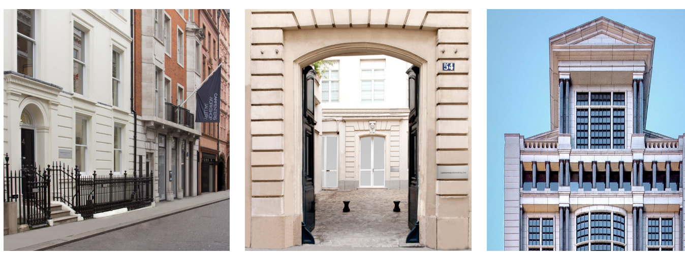
LONDON | PARIS | NEW YORK