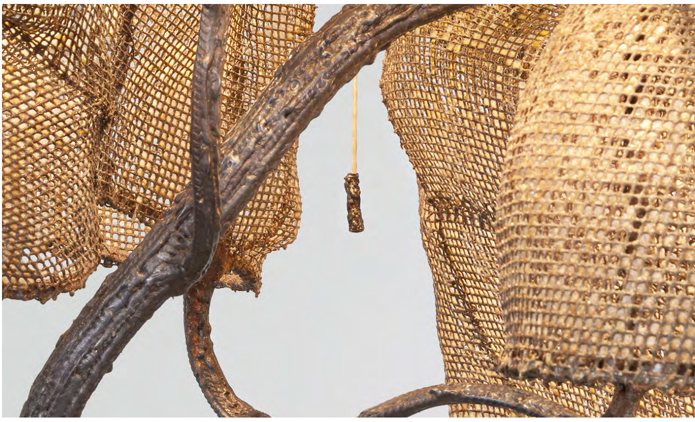
NACHO CARBONELL | FLOOR LAMP CRONCRETE BASE 5 | DETAIL COURTESY CARPENTERS WORKSHOP GALLERY