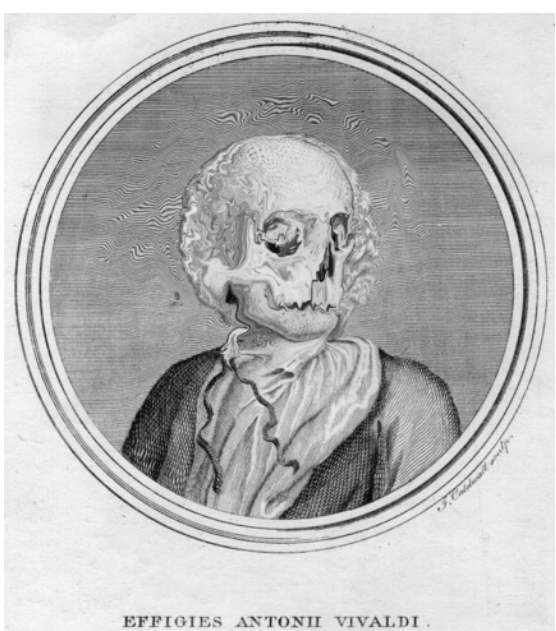
Effigies Antonii Vivaldi