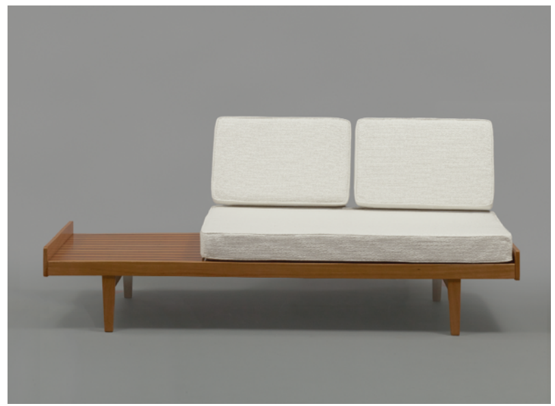
Pierre Paulin, Banquette 118 (Bench 118) Edition Meubles TV - 1953