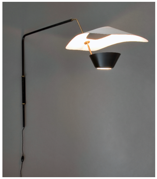
Pierre Guariche, Applique G25 known as "Cerf-volant" (Kite) Edition Disderot - 1951