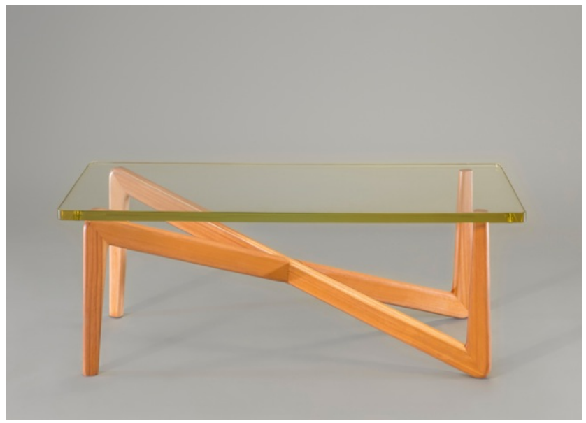
René Jean Caillette, Table basse (low table) Edition Charron groupe 4 - 1954