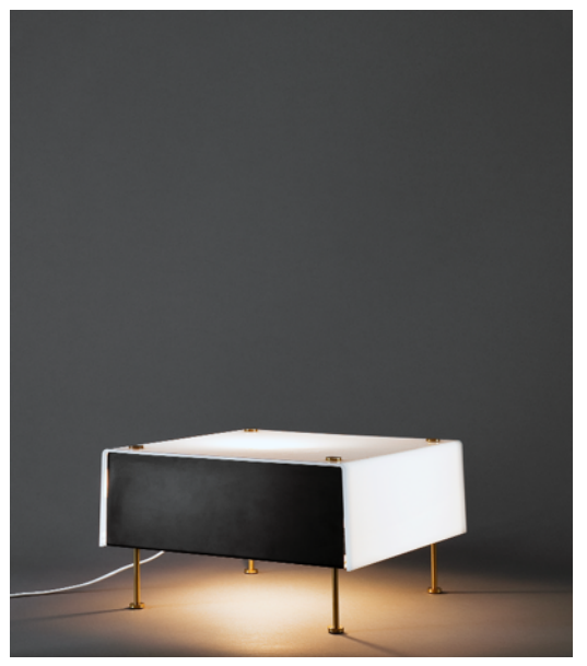
Pierre Guariche, Lampe G60 (Lamp G60) Edition Disderot- 1959

This extremely chic setting is arranged on a light wood background, in varnished elm, in a muted colour range, scarcely highlighted with a few touches of lacquered metal in black or touches of white on the lamps.