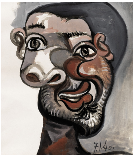
46 x 38 cm ; 18 x 14 in.