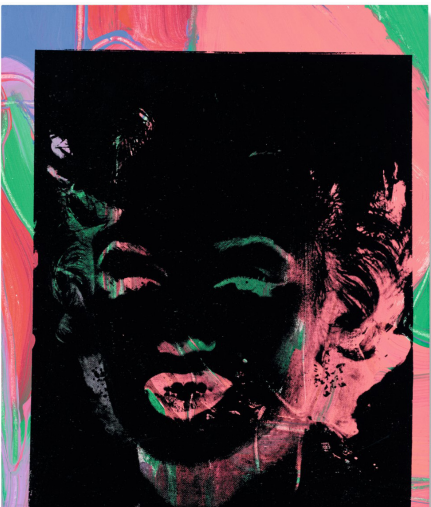
50.8 by 40.6 cm. 20 by 16 in.