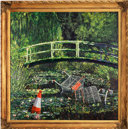
143.1 by 143.4 cm. 56.4 by 56 ½ in