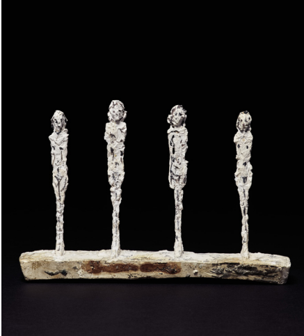
21,5 cm ; 8½ in