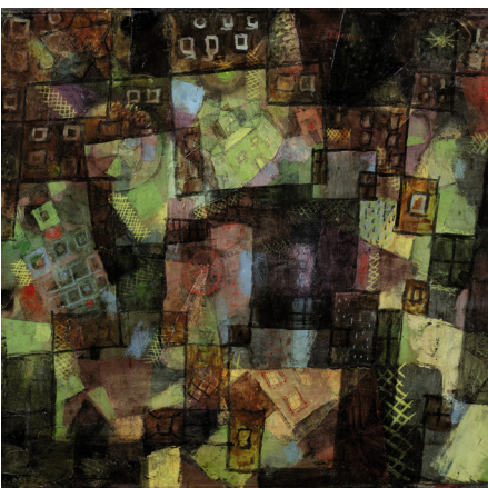
46,3 x 56,2 cm ; 20 x 22 in.