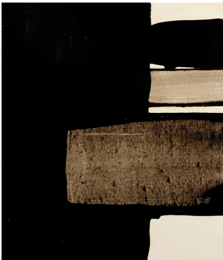
73 x 60 cm ; 28¾x 23⅝in.