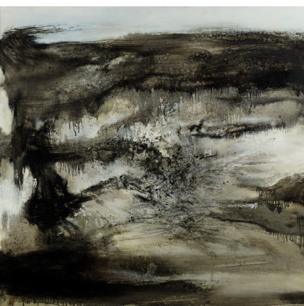
95 x 105 cm ; 37 7/16 x 41 5/16 in.