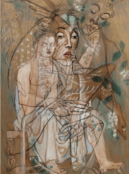
150 x 95 cm ; 59 x 37 in.