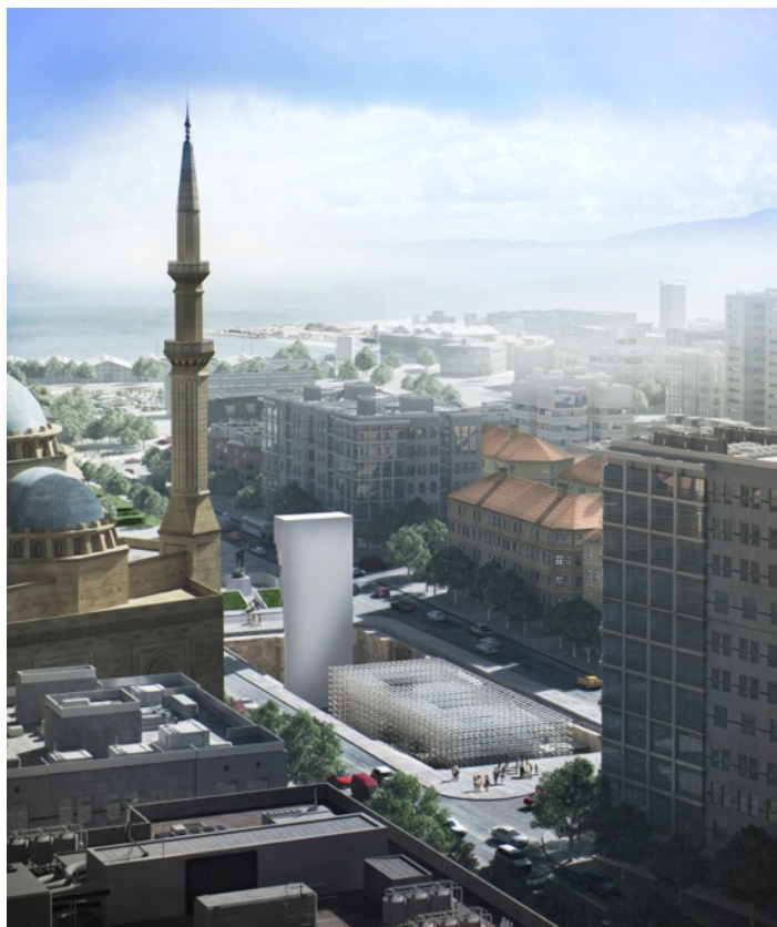
Visuel 3D - Museum of Civilizations 3D architectural rendering, 2014. Courtesy GM Architects

GM Architects will present the Museum of Civilizations's exhibition at Metropolitan Art Society Gallery, Beirut, from 24 March to 24 April.