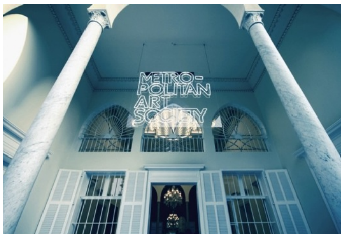
View of Metropolitan Art Society Gallery