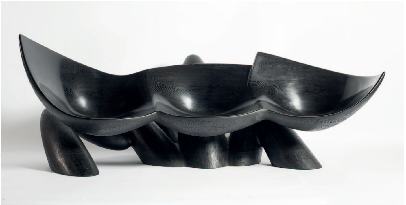
WENDELL CASTLE | SIXTEEN HUNDRED 2013, STAINED ASH WITH OIL FINISH, H90.8 L246.4 W140.3 CM / H35.7 L97 W55.2 IN, UNIQUE

For its second participation in la Biennale des Antiquaires, Carpenters Workshop Gallery will present on its booth unique artworks by American designer Wendell Castle, showcased within a scenography by French artist Ingrid Donat.