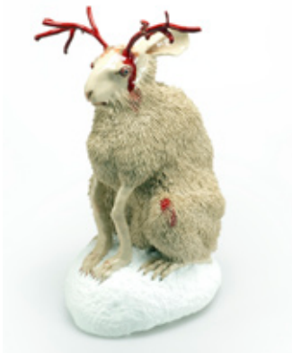
Carolein Smit, White Hare , 2011 Ceramics, Height: 45 cm

Among these exhibitors, six young galleries with less than 4 years under their belt, selected by a prestigious international committee, will form the «Emergence» section, a sign of the fair's commitment to highlight the latest up and coming artists.