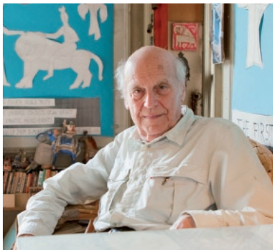
Yona Friedman chez lui, 2009