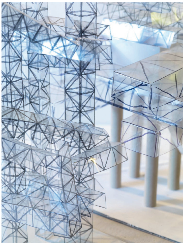
Yona Friedman, Model (detail)

AUCTIONED BY CORNETTE DE SAINT CYR ON SATURDAY 22 OCTOBER 2011 AT DROUOT-MONTAIGNE, PARIS