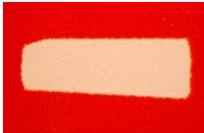
Gift, Zizou series, 2007 - Photograph, 30 x 22 cm

Russiantearoom, Paris featuring Dmitry Sokolenko www.rtrgallery.com