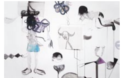
Ne vois-tu, rien venir ?, 2010 - Watercolor and ink on paper, 140 x 200 cm

Ladiray Gallery, London featuring Vincent Bizien www.jeromeladiray.com