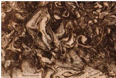
Revelation XI, 2009 - Pyrography on plywood, 32.5 x 24.5 cm (detail) - Courtesy Room Art Space

Room Art Space, London featuring Gordon Cheung www.roomartspace.co.uk